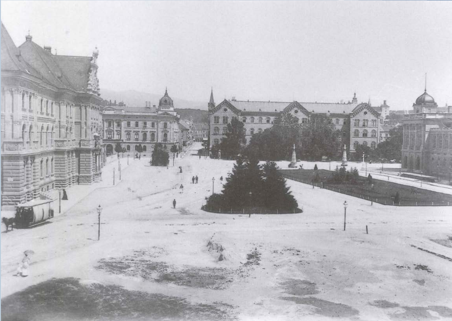
University building around 1900