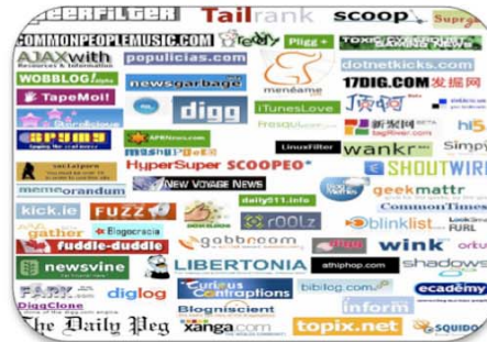
AV in web2.0 (social media)